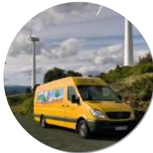
“Protecting the environment”

Minimizing the impact of our business activities on the environment